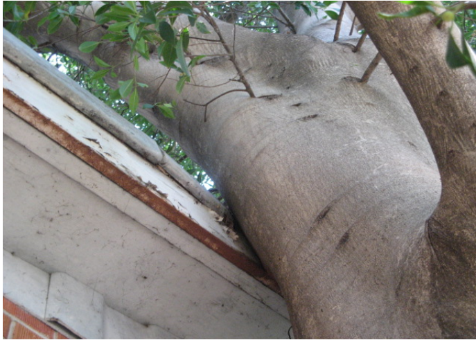
Photo 9. ACM dust settlement from sports hall roof Photo 10. Tree causing damage to ACM roof