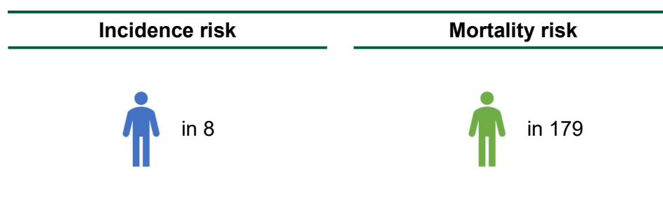
Table 71. Prostate cancer: estimated cumulative risk to age 75 years in males, Western Australia, 2019

Note: Incidence/mortality rates for counts <20 are not provided as they are not reliable.