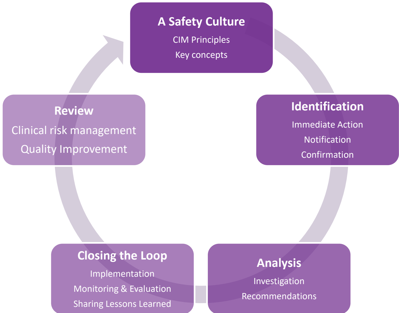
Figure 1: Clinical Incident Management Process

Although a very big focus in CIM is investigation and analysis of a clinical incident, it is one of many components within the CIM process. Each health service organisation may have slightly different actions however the major key steps are outlined as below in Figure 1.