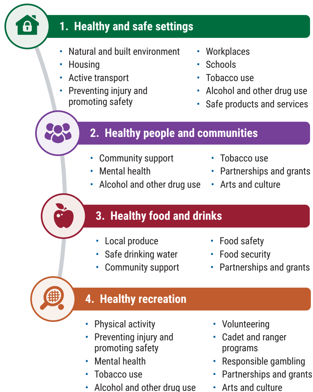
Figure 2: Cross sector mapping – domains and sub-themes

A brief overview of individual Department and Agency initiatives, strategies and policies and initiatives is provided in Section 7. This identifies areas of shared interest and key strategies, policies and initiatives relevant to chronic disease and injury prevention.