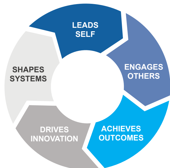
Figure 3: Health LEADS competency framework